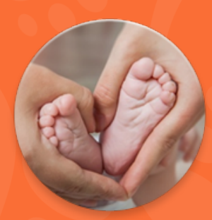
CHILDREN'S FOOT CARE