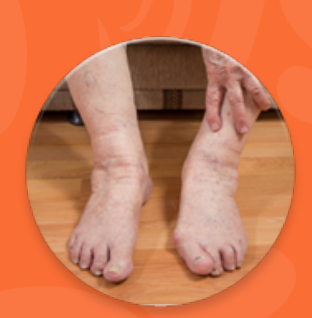
DIABETIC FOOT CARE